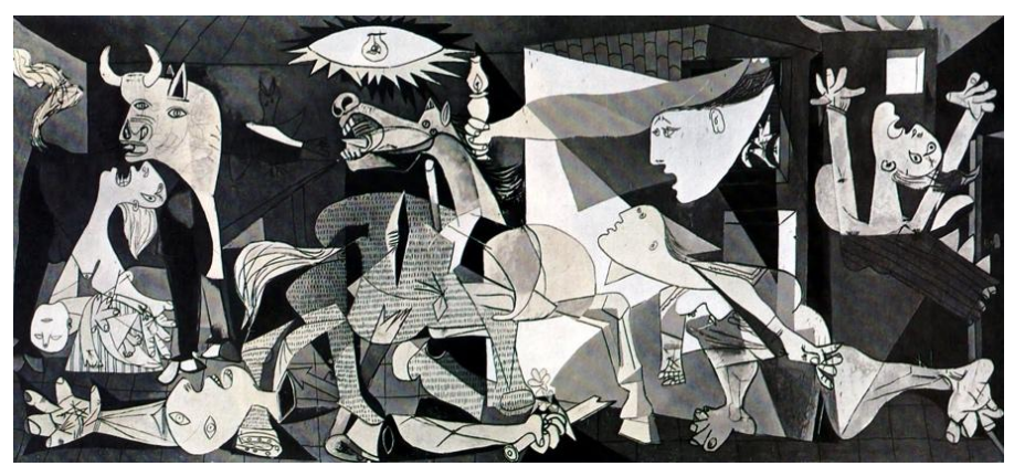
Figure 5 The Cubist School - Guernica (1937), by the Spanish artist Pablo Picasso