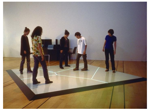
Figure 8 Interactive art...work titled "Frontier Quests" (1998) by Scott Snippy at the NTT Communication Center in Tokyo

Conceptual art was presented by the American conceptual artist Joseph Kossuth, who found that the interactive art technique based on using modern technology such as photography and video art would assist in achieving added value to the artwork. The receiver can interact with the artwork dynamically and not just emotionally. The following examples presented in figures 8 and 9 represent contemporary artistic trends (Postmodern art).