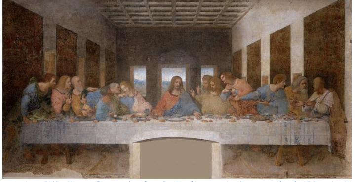
Figure 3 Mural painting (The Last Supper) - by the Italian artist Leonardo da Vinci - Italian Renaissance