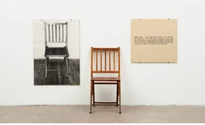
Figure 9 Conceptual Art ... Joseph Kosuth, A Chair and Three Chairs, 1965, Museum of Modern Art, New York