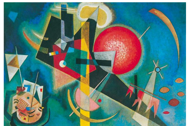
Figure 6 Abstract school model - In the blue 1925, by the Russian artist Wassily Kandinsky