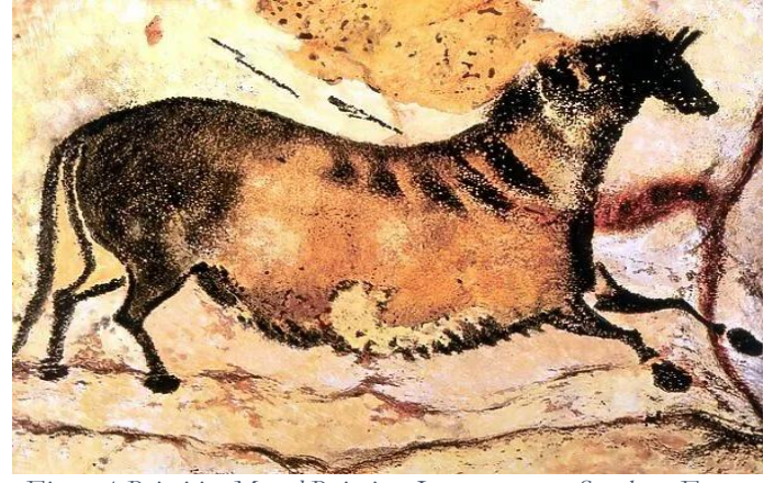
Figure 1 Primitive Mural Painting, Lascaux cave, Southern France

Figure 1 shows an example representing painting artwork from the primitive era. This painting is in Lascaux Cave in the south of France. It depicts a moving horse, although the subject is quite clear, the value of the work doesn't lie in it. However, the value is highlighted through the credibility of its expression and its artistic culture and sense.