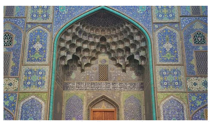
Figure 4 An example of using Arabic calligraphy and Islamic decoration in Architecture.