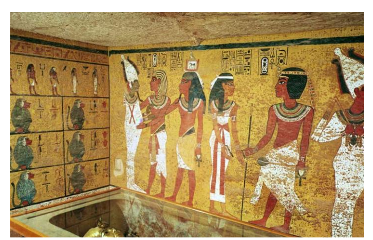
Figure 2 A mural painting, ancient Egyptian civilization - Tutankhamun's Tomb, Luxor, Egypt

From the above discussion, it is evident that "Creed" is the main approach to comprehending the fine arts and the key source of artworks' subjects' inspiration in the successive human civilizations. While unique aesthetic artistic solutions and appropriate techniques were developed to express these subjects affected by the geographic, economic, and technologic development of each civilization. The following three examples from Figure 1, Figure 2, and Figure 3 show examples of artworks produced in the ancient Egyptian, Christian and Coptic civilizations which are a clear reflection of the idea of the faith influence on drawn and represented subjects expressing these stages.