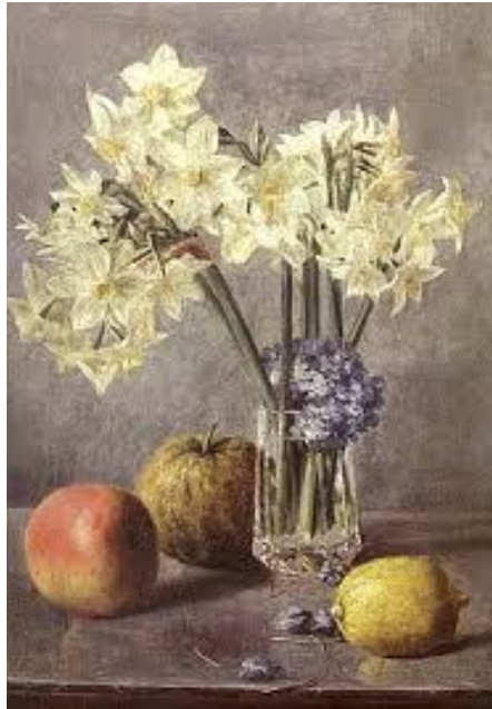
Figure 9: Still Life , Suleyman Seyyid (1842-1913)

Source: Istanbul State Museum of Painting and Sculpture