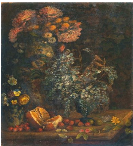
Figure 13 Still Life , Huseyin Zekai Pasa (1859-1919)

But in this work HuseyinZekaiPasa painted a romantic still life full of flowers and fruits under sinking sun or a very pale light in detail and accurate as size, form and structure. On the painting, there are asymmetrically balanced composition, neutral colors scheme with slight pale blues, yellows, oranges and greens. The flowers and fruits are as beautiful as they can, fresh and perfect in an unknown place. As real as they can but in another world like in dreams.