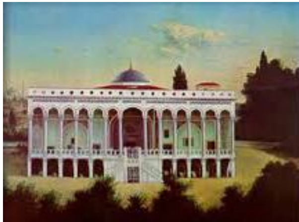
Figure 6: Tiled Kiosk, Eyuplu Cemal (1836-1898)

Source: Mimar Sinan Fine Arts University Istanbul Museum of Painting and Sculpture Collection