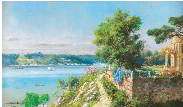
Figure 14: To Bosphorus from Cubuklu Hills, Hoca Ali Rıza (1864-1930)