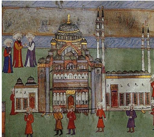
Figure 1: Suleymaniye Mosque, Nakkas Osman (late 16 th century)