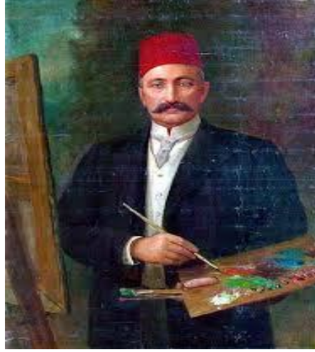
Figure 8: Self Portraits, Seker Ahmet Pasa (1841-1907)

Source: Mimar Sinan Fine Arts University Istanbul Museum of Painting and Sculpture Collection