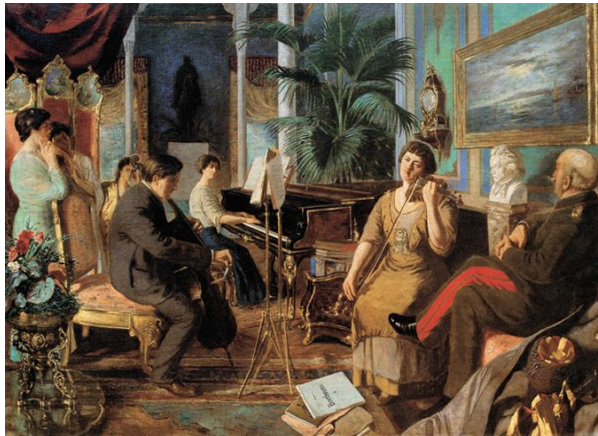
Figure 16: Beethoven in Harem , Abdulmecid Efendi (1868-1944)