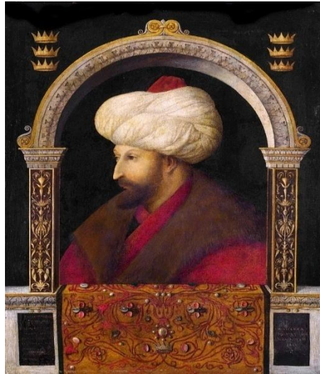
Figure 2 Mehmed II, the Conqueror, Gentile Bellini (1429-1507)