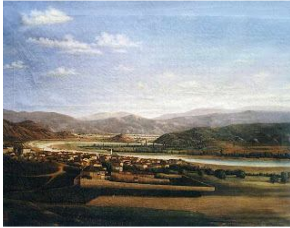
Figure 10: The Town Lefka , Ahmet Sekur (1856-?)