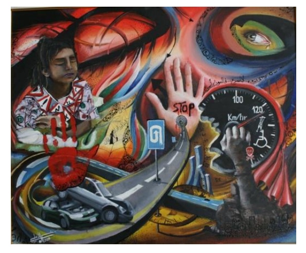
Figure 6: symbols of causes and consequences of road accidents, (oil on canvas), 75cm × 55cm.

The composition of painting (Figure 7) can be divided into three parts. Student in this painting calmed that "One depicts the result of a car accident, and the other two address the causes. The colours used are mostly dull and washed out, suggesting grief. The lines are sharp, and simple geometrical shapes are used". It can be said also, the level of light is low and has no definite source. Moreover, this student emphasised that "The content of middle panel in my painting implies the effects of not wearing a seat-belt. Also, in the middle of the road there are cars that have been damaged in an accident and blood is strongly represented".