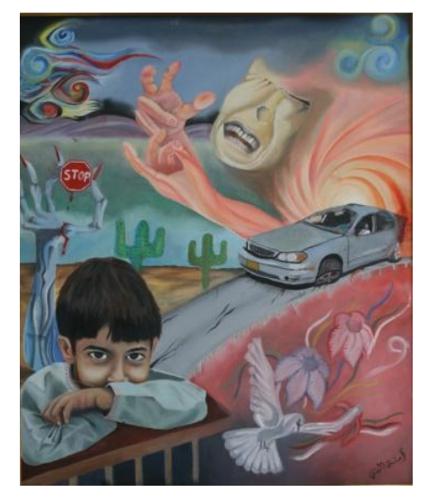
Figure 10: visible and invisible damages of road accidents, (oil on canvas), 75cm × 55cm.

The composition of painting (Figure 11) is vertical and the elements are distributed from bottom to top in the shape of a pyramid. The elements that consist the painting are roads, cars, buildings and a child. Juxtaposition and paradox are represented by the cold and warm colour tones.