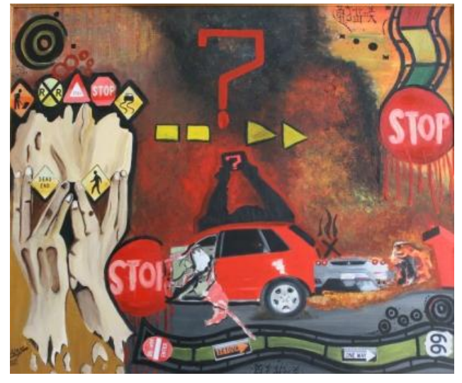
Figure 13, Symbolic way of road accidents, (oil on canvas), 75cm × 55cm.

Painting in figure 13 addresses the causes and effects of road accidents due to disregarding road signs. The signs, cars, roads and a face constitute the painting. Moreover, of the colours that are present, red takes the lion's share. As student emphasised that "My painting representing danger and death of the road accidents. The painting background is a mixture of cold and warm primary and secondary colours. There are geometrical and curved shapes in this work". In this painting, text is also present in the 'Stop' sign. The meanings conveyed by these elements are the close affinity between pain and sorrow on the one hand, and accidents on the other. In addition, road signs replace the eyes of the face on the left, and other signs appear above the head. All these icons and art elements present causes and consequences of road accidents in abstract forms and symbolic way.