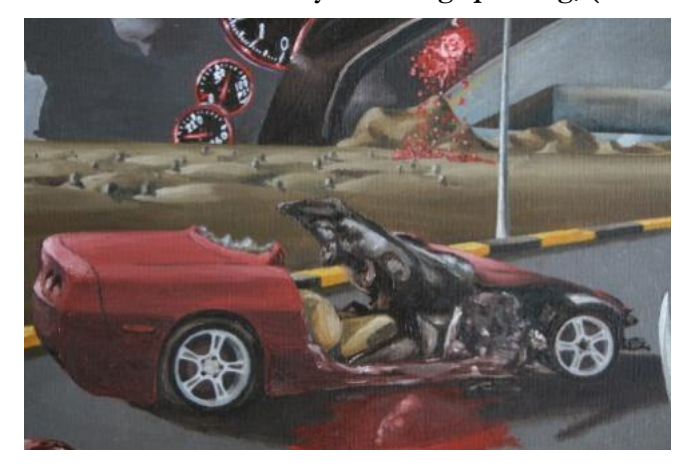
Figure 8: Painting of speedometer stained with blood symbolizing speeding, (oil on canvas), 75cm × 55cm.

The painting in figure 9 has a pyramidal composition. This places great importance on the background. The student has concentrated on creating perspective by using the lines of the road, which draw the viewer's eyes to the focal point and the work's visual interest: the speedometer that the driver is heading toward. This was supported by student when she said "My painting places the viewer in the position of the driver. From this perspective, the viewer can see some human skulls emerging from the speedometer, and two damaged cars in front of it, on a road that has been torn apart". All these elements signify the danger of driving too fast on public roads and draw attention to follow the traffic system with respect and dignity.