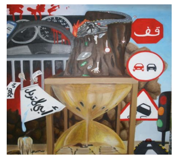
Figure 3: Painting includes several signals symbolizing of the car accidents, (oil on canvas), 75cm × 55cm.

Painting 4 has two elements (Figure 4). The first shows the immediate causes of traffic accidents, while the second reflects their catastrophic consequences. Student described her work by saying "My painting depicts roads, traffic signals and human silhouettes. It is dominated by red and black, with a small amount of grey and a complete absence of light. Also there are straight and curved lines". Student in this painting belief in respecting the traffic signs system, she emphasised that "The traffic signals and signs are the most important tools". Furthermore, she explains her signs by saying "The silhouette of a man overwhelmed with melancholy represents a sign for controlling on traffic public roads. The deep, dark colours are exemplified by red, which announces the approach of danger". It can be also said that the black colour represents sorrow and condolence. Furthermore, there is a complete absence of white in this work.