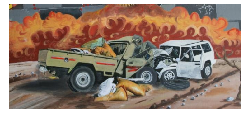
Figure 5: Painting face to face accident, (oil on canvas), 75cm × 55cm.

In figure 5, the painting refers to the immediate and material losses resulting from road accidents. We notice that a lot of objects are scattered from the rear of the vehicle, falling to the ground as a result of the force of a collision. In the background we notice dust billowing up due to high speed. Student explains his opinion saying "I think face to face accident is very dangerous and this happens because of car overtaking in wrong time and wrong place and that why I did my painting in this composition".