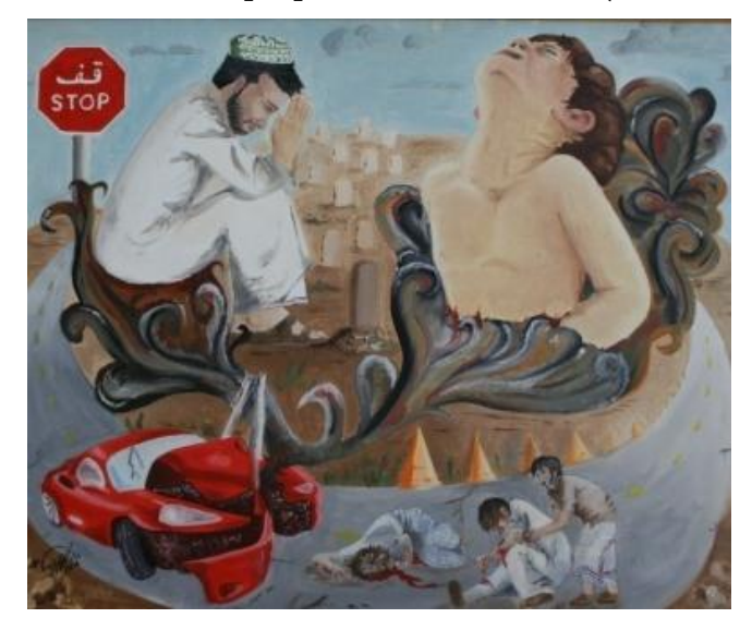
Figure 14: Shown the effects of accidents on people and their relatives, (oil on canvas), 75cm × 55cm.

In figure 14, student addresses the effects of accidents on people and their relatives. As student described: My painting portrays a funeral scene in which a father is seen in a graveyard showing signs of sorrow and melancholy. A 'Stop' sign is installed behind him in the top left of the work, which is one of the focal points, and the child is wrapped in clouds of smoke instead of a coffin. At the bottom of my work, there is a group of three people who have been injured in the accident that has taken the child's life. The general composition of this painting is circular, making the child and graveyard the centre of the circle in an attempt to draw the viewer's attention to the necessity of linking the two issues. The shapes present in the work are mostly curved, and the colours used are faint, engulfed by death from all sides.