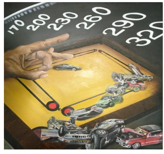
Figure 2: Painting of road accidents as a carrom game, (oil on canvas), 75cm × 55cm.

Figure 2 demonstrates the causes and consequences of road accidents due to excessive speed and the driver's lack of care. Speeding is illustrated by the image of a speedometer. Student commented that "My painting refers to a board game called Carrom , in which the players roll dice. I replaced the dice image with a car. It depicts fate on the one hand, and the imprudence of the driver on the other". Furthermore, she emphasised that "The game board is yellow and red; red symbolizes death, while yellow symbolizes the approach of danger". In the researchers' point of view, the consequences of car accidents are tragic and the loss they cause is irreparable. The task was to put the spotlight on the consequences of fatal car accidents caused by the recklessness and childishness of road users. The researchers then asked the students to comment on the causes and consequences of road accidents as presented in this painting, Student emphasised that "The result is a tragic loss of lives and property; my painting shows the damaged cars scattered everywhere and piled on top of each other due to collisions and excessive speed".