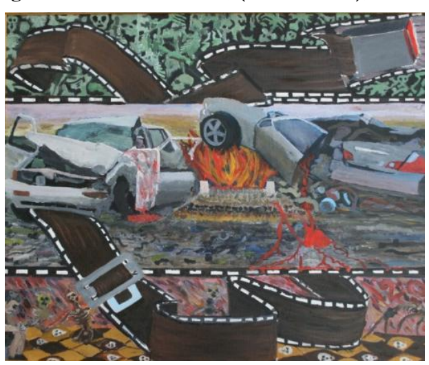
Figure 7: Painting of accident three in one, (oil on canvas), 75cm × 55cm.

In Figure 8, the painting deals with the causes of road accidents and the damage they do to people and property. Student described his painting as: "complex work and can be divided into several sections; some representing the causes of accidents, and others addressing the resulting effects. The colours used are of great importance. They have distinctive symbolism: red symbolizes danger, and black symbolizes sorrow in general and death in particular".