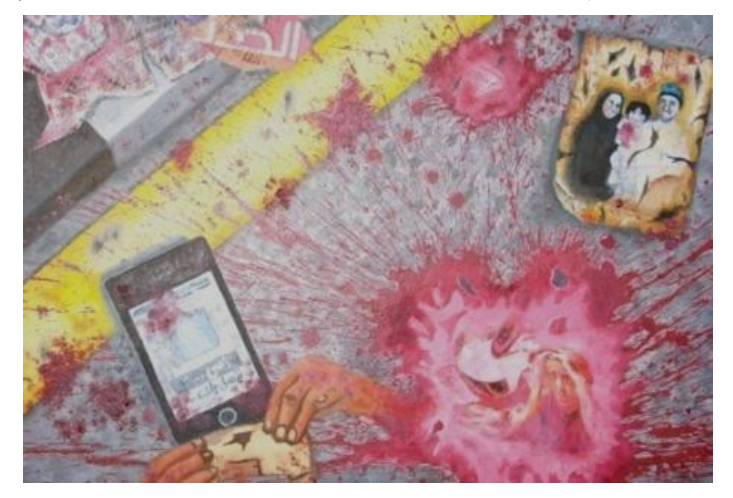
Figure 16: presenting family's memories in references to road accidents, (oil on canvas), 75cm × 55cm.

Finally, from the students' paintings and students' interpretations of these paintings, we categorized that primary causes of road accidents in Oman appear to be a result of driver behaviour, for example, not using seat-belts, speeding, using mobile phones, sending text messages, adjusting the radio or the CD player.