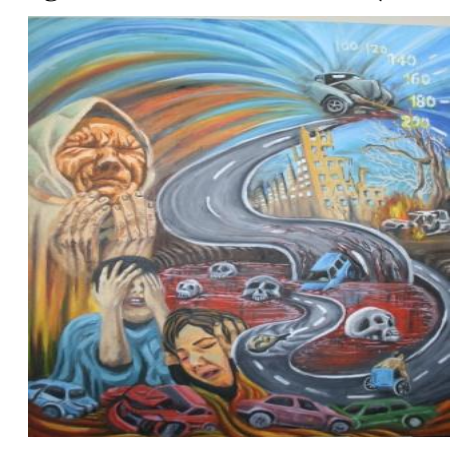
Figure 12: Speeding is the leading cause of road accidents, (oil on canvas), 75cm × 55cm.

In this painting, we see a weeping woman placing her hands over her face, crying over the loss of a loved one and looking dejected and sad. Two children are also crying over the loss. This student explains her symbols furthermore by saying "The elements reminding us of the fallout from accidents are the human skulls, which lead to the context of the death. The viewers can also find a person using a wheelchair, which shows the harm that road accidents inflict on those involved". Reflecting on the student's statements and the composition of her painting, the researchers also sees the elements that represent the causes of these accidents are the cars and speedometer, since speeding is the leading cause of road accidents.