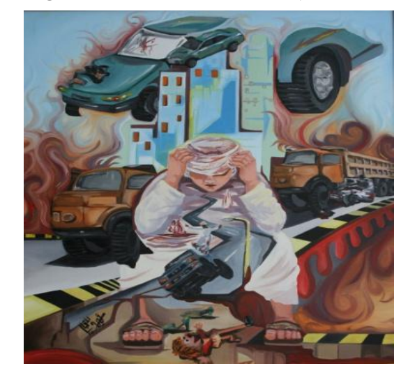
Figure 11: Painting presenting the curse of road accident, (oil on canvas), 75cm × 55cm.

In Figure 12, many signs and signals show us the damage caused by road accidents. The general composition of the painting is divided into several parts or elements. In this painting, we see women, children, cars, a wheelchair, roads, buildings, skulls and a speedometer. Student of this painting, comments: Every element in my painting has its own significance, symbolism and purpose. You can also find a variety of viewing angles; there are central, horizontal and vertical ones. I used range of colours from warm to cold. The structure of the painting is horizontal, and the extension travels up.