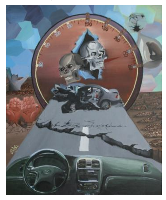
Figure 9: Representing driver as viewer with reference to causes and consequences of road accidents, (oil on canvas), 75cm × 55cm.

Painting in figure 10, deals with the damage that road accidents do to people and property. Student explains her painting by saying: "The composition in my painting divides into two horizontal sections: the bottom one represents a child (consequences), and the middle one stands for the road and car (causes). The bottom section portrays a picture of a child looking sad due to the loss of a loved one, and the car in the middle section is behind him. The purpose is to show that the car is the cause of this tragedy. A skeleton of a human hand holds a road sign that drips with blood".