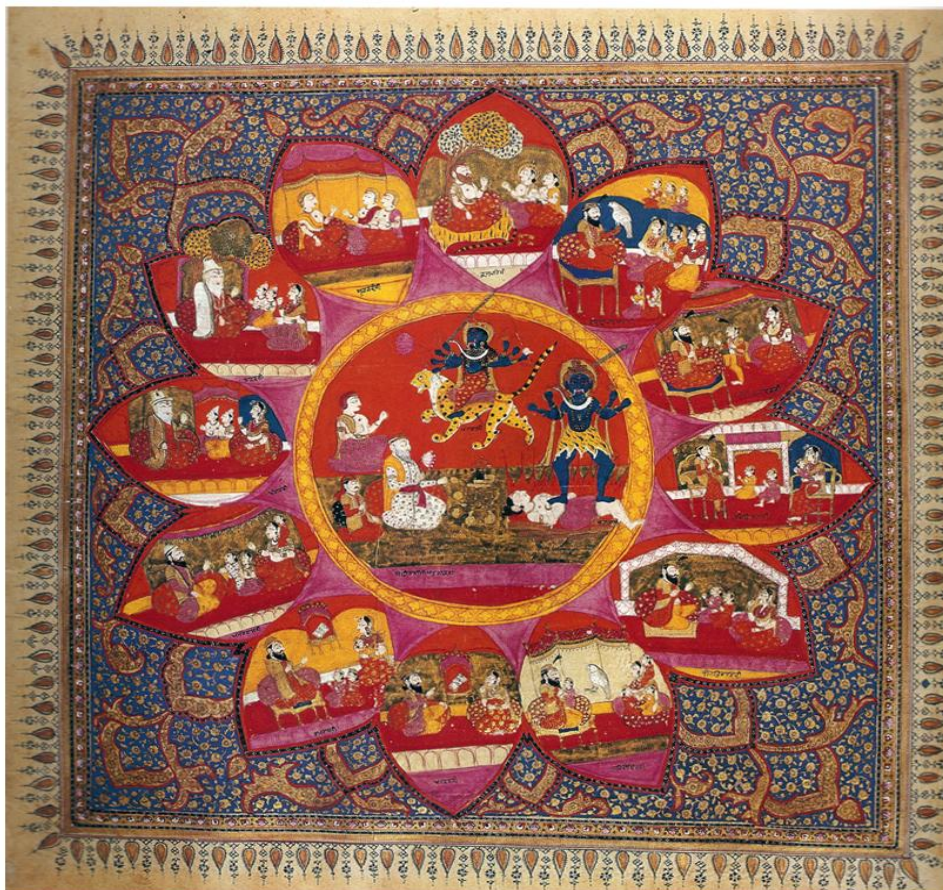
Pl.6. Illuminated space from folio from AdiGranth , Collection of National Museum, Delhi

However, it is interesting to note that certain hymns from the AdiGranth specifically include the nomenclature of flowers such as lotus, poppy, safflower, lily etc. For instance, the first Guru Nanak Dev ji, lucidly articulated his contemplation on flowers in an excerpt from Page 23 of the Guru Granth Sahib in Sri Raga , second house. Translation: “You are the lotus flower of the day and you are the water-lily of the night. You yourself behold them, and blossom forth in bliss.”