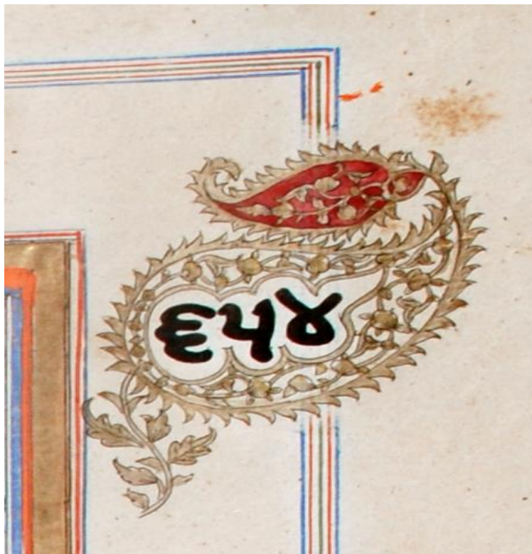
Pl.7. Illuminated pagination from folio from AdiGranth , Collection of National Museum, Delhi

The motif of the ‘paisley’ is ubiquitous to the arts of Kashmir and is widely referred to as ‘ ambi ’ in Punjabi, derived from the word amb which means a mango. Small sized ambis , generally rendered in maroon and gold are interspersed within the script, for marking the beginning of a new hymn and enlivening the severity of the black ink. It seems that the artists decided to restrict the use of butas within the script and favoured the stylized ambi motif, creating a sense of consistency in most of the folios. Since the loveliness of ambi found a favoured use by the illuminators; we find numerous variations of this motif in pagination as well. A refined example may be found on folio 654 of the AdiGranth at the National Museum (pl. 7). The numeral is scribed in a sophisticated rendered serrated leaf which has a curving tip that forms a paisley. The refinement in execution is evident in terms of disposition, drawing as well as colouring; creating a marked stylistic difference from the cursory rendered motifs. Apart from these, patterns with shapes such as the ogee and betel or paan leaf also add to Kashmiri artists’ visual expression.