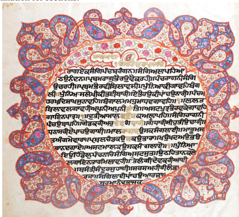
Pl.1.Illuminated Ragamala folio from AdiGranth, Collection of National Museum, Delhi