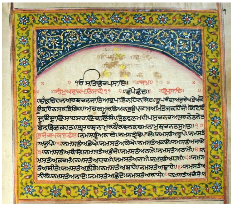
Pl.5.Illuminated folio from AdiGranth, Collection of Guru Nanak Dev university, Amritsar

As the demand for illuminated copies of AdiGranth grew, traditionally the script came to be illuminated heavily. The script was bound by a thick border of a continuous pattern formed by permutations and combinations of interlocking shapes painted against a vibrant background of a flat colour. In an illuminated folio of AdiGranth from the collection of Guru Nanak Dev University in Amritsar, that may stylistically be attributed to early years of the twentiethcentury, a square format of the manuscript displays a mangal scribed in the horizontal center followed by the prayer of jaap sahib in Gurmukhi script (pl. 5). The topmost part of the scribed area has an adorned blue arch. The border consists of a yellow band with a belbuta of blue stylized flowers, arranged spaciouly. Stylistically, in terms of the cursory rendition of motifs as well as crude choice of colours, it suggests a definite decadence in the art of Sikh manuscripts. Gradually, the art of illumination succumbed to the lack of patronage and availability of standardized printed copies; which were mechanically adorned with lines and thin floral borders in limited colours.