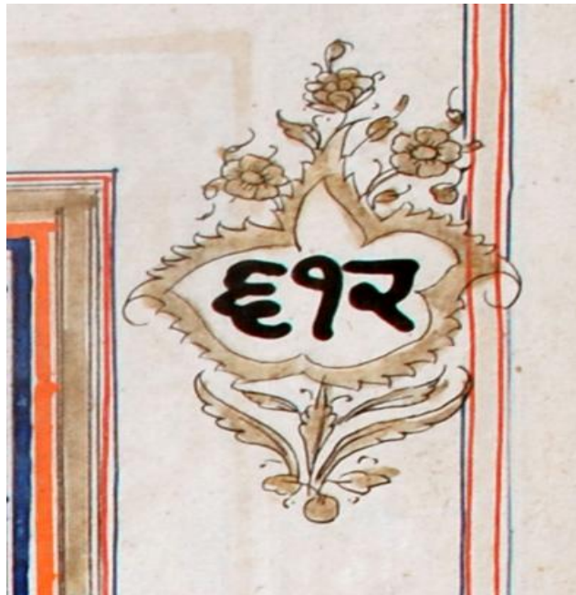
Pl.4.Illuminated pagination from folio from AdiGranth, Collection of National Museum, Delhi

As the demand for illuminated copies of AdiGranth grew, traditionally the script came to be illuminated heavily. The script was bound by a thick border of a continuous pattern formed by permutations and combinations of interlocking shapes painted against a vibrant background of a flat colour. In an illuminated folio of AdiGranth from the collection of Guru Nanak Dev University in Amritsar, that may stylistically be attributed to early years of the twentiethcentury, a square format of the manuscript displays a mangal scribed in the horizontal center followed by the prayer of jaap sahib in Gurmukhi script (pl. 5). The topmost part of the scribed area has an adorned blue arch. The border consists of a yellow band with a belbuta of blue stylized flowers, arranged spaciouly. Stylistically, in terms of the cursory rendition of motifs as well as crude choice of colours, it suggests a definite decadence in the art of Sikh manuscripts. Gradually, the art of illumination succumbed to the lack of patronage and availability of standardized printed copies; which were mechanically adorned with lines and thin floral borders in limited colours.