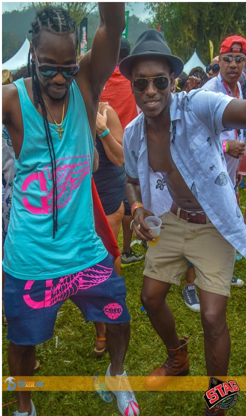
Figure 24. Men at fete