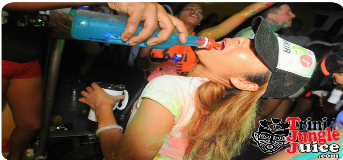
Figure 22. Carnival alcohol consumption