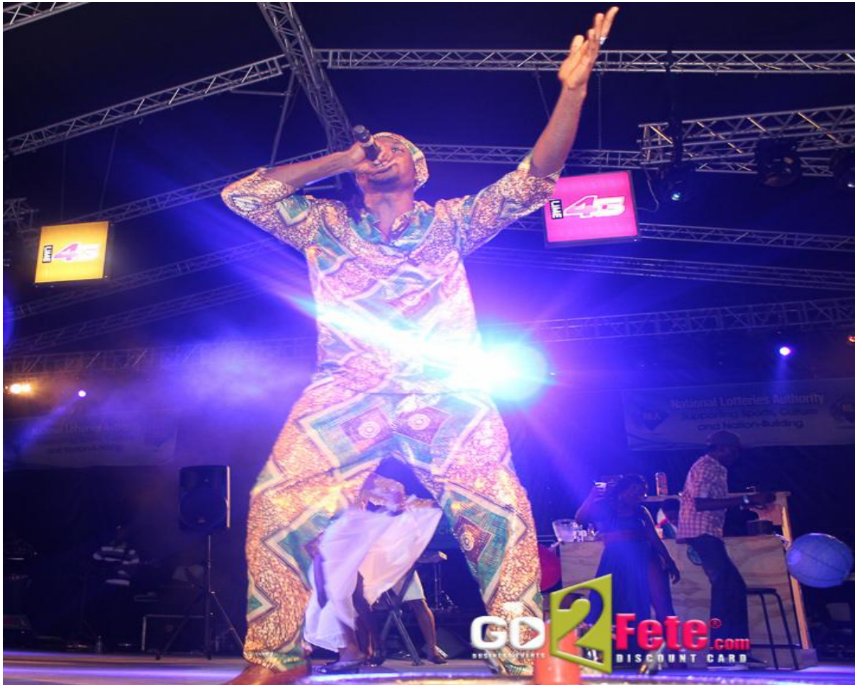
Figure 13. Soca monarch performance, Grenada