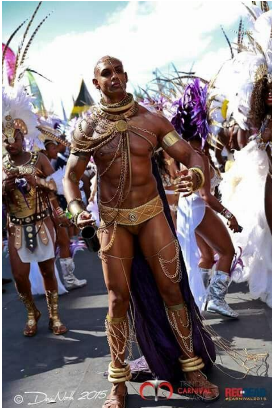
Figure 33. Man playing mas