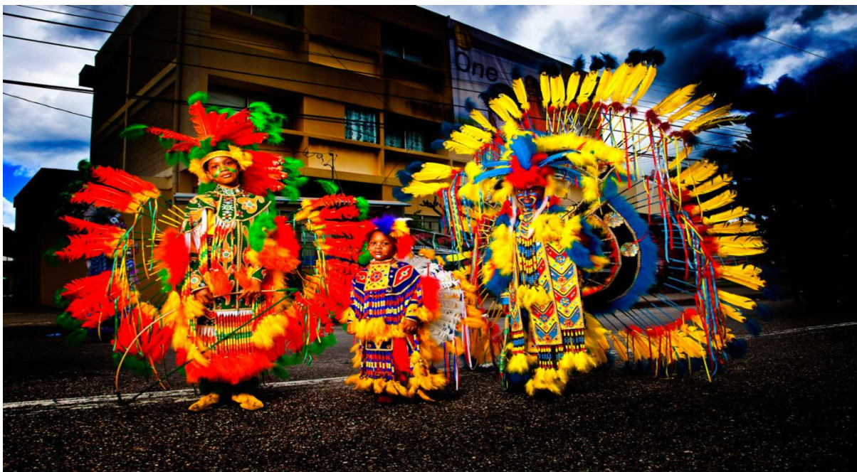
Figure 3. Fancy Indian