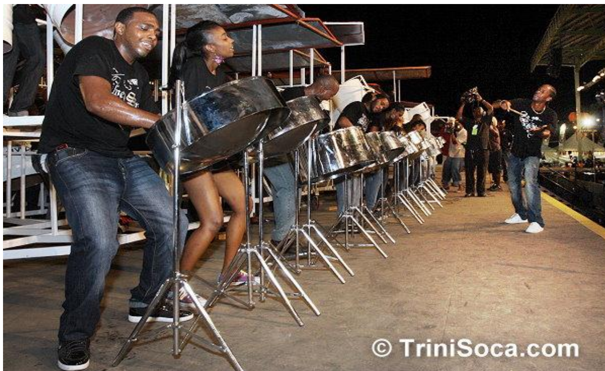
Figure 15. Panorama/steelpan, Trinidad