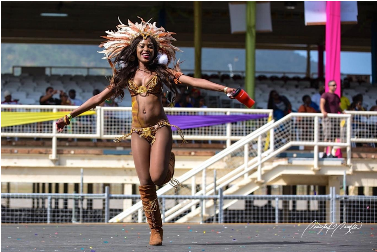
Figure 28. Costumed woman dancing on stage