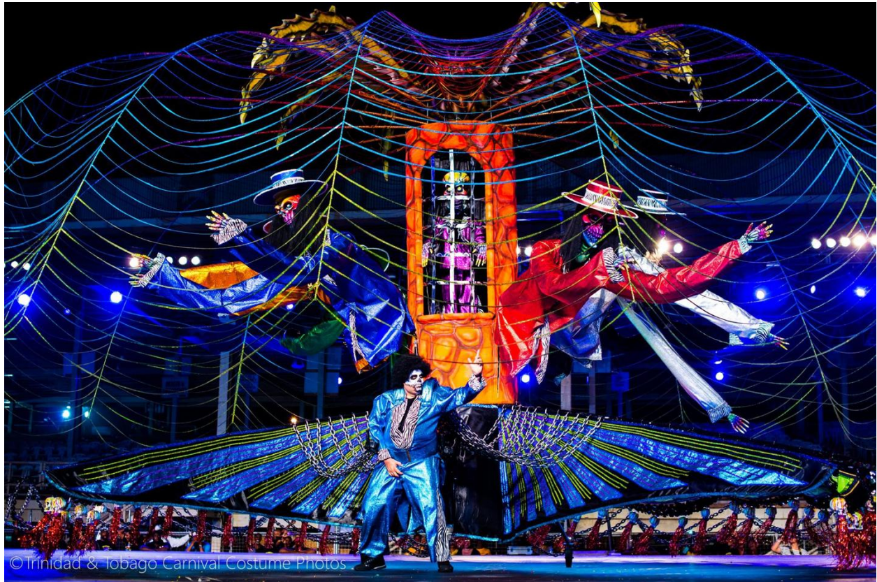
Figure 17. Dimanche gras: King costume