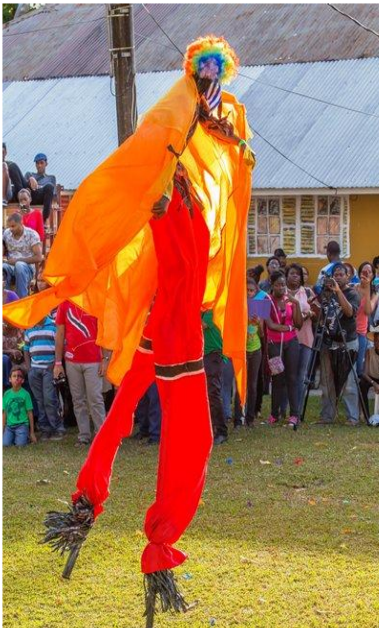
Figure 7. Moko jumbie