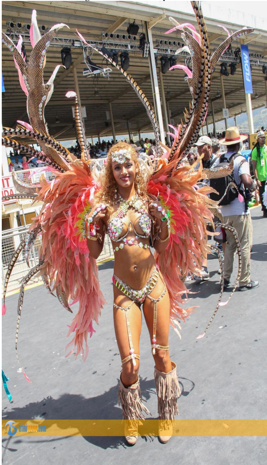
Figure 27. Female masquerader