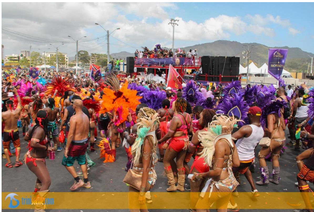
Figure 20. Parade of the bands