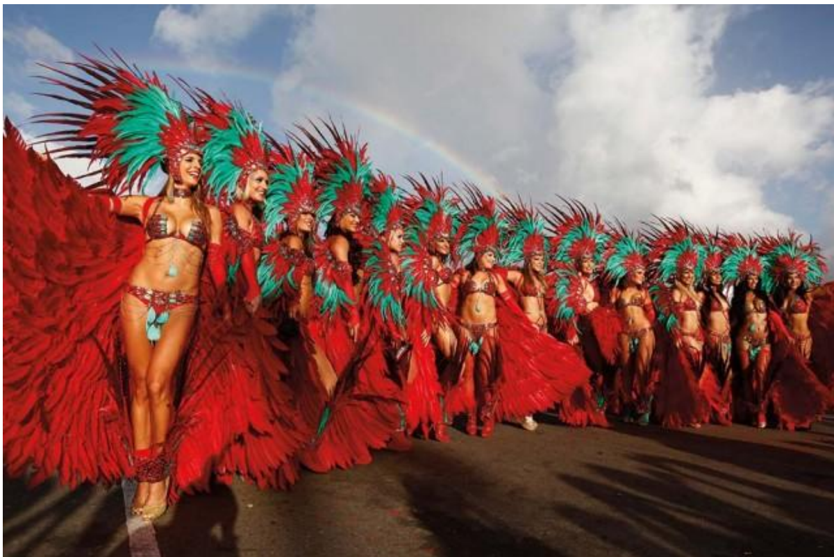
Figure 31. Female ‘Rio-styled’ pageantry, Trinidad

Women, in particular, are continuously urged to protect themselves. As previously stated, the use of condoms as has been minimal despite broad media publication and mass distribution of condoms by relevant agencies. The result has been high STIs among women, increased pregnancies, and overwhelming usage of the morning after pill. In Trinidad, there has been a campaign around use of the female condom. Boodan (2009) informed the public that these female condoms are readily available from the One Overcomers Club [VOCC]. Boodan (2009, ¶ 6) reported that VOCC’s head insinuated that, “asking an intoxicated man to use a male condom was like having a drunk person drive.” Additionally, Maharaj, (2009) urges women to pay attention to how they allow themselves to be treated during the Carnival season. Bad treatment, in the form of disrespectful comments by men, is often ignored, and this can have repercussions for women in their everyday lives (Maharaj, 2009). The general message promoted during Carnival is that the celebration can be an occasion for safe, clean, fun and all persons should lead sexually responsible lives.