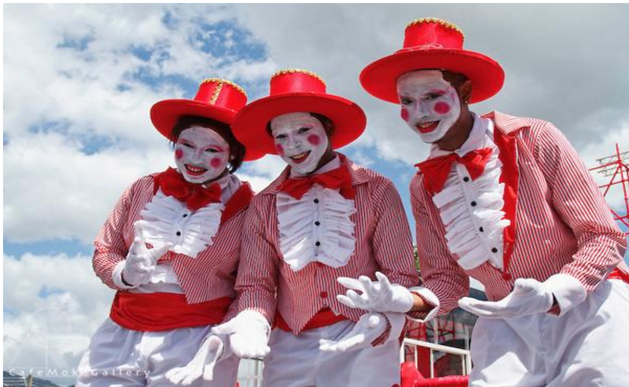
Figure 11. Minstrels