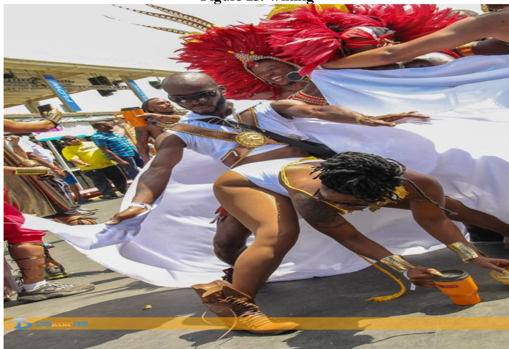
Figure 23. Wining