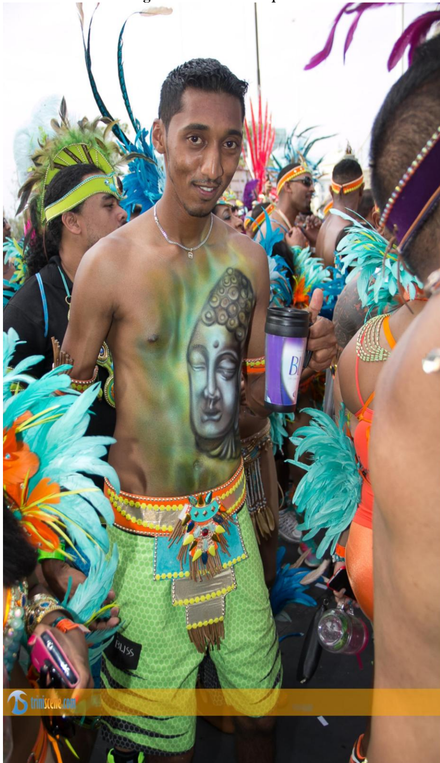
Figure 32. Man in mas parade