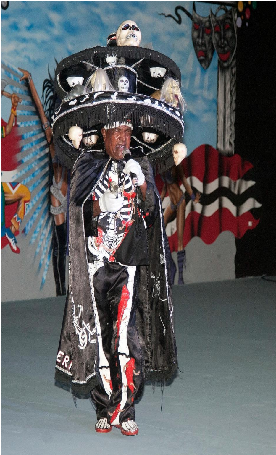
Figure 6. Midnight robber