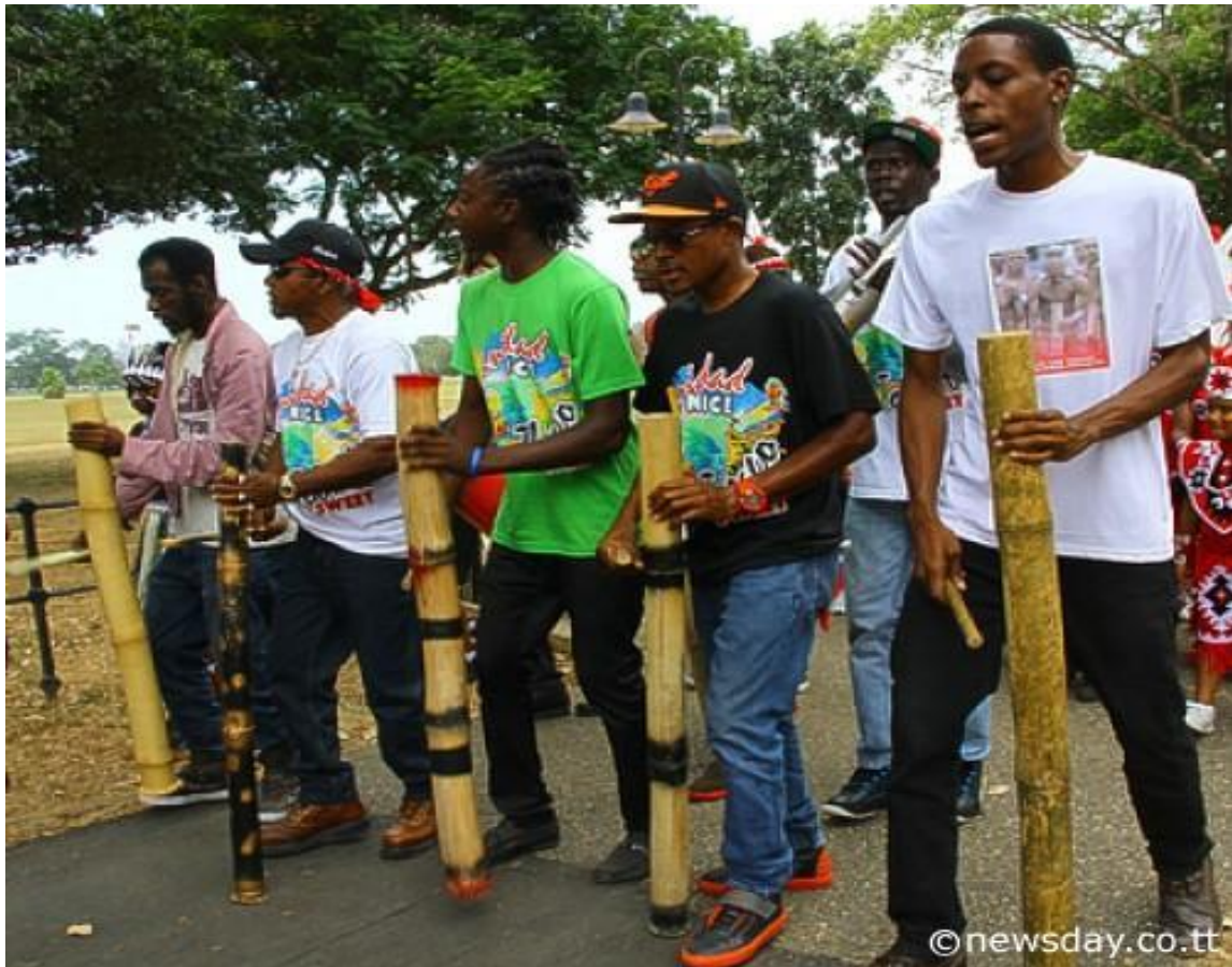
Figure 2. Tambu bamboo