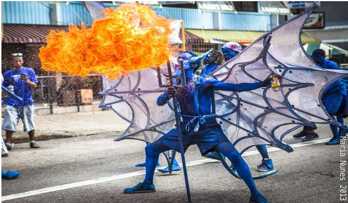
Figure 8. Blue devil