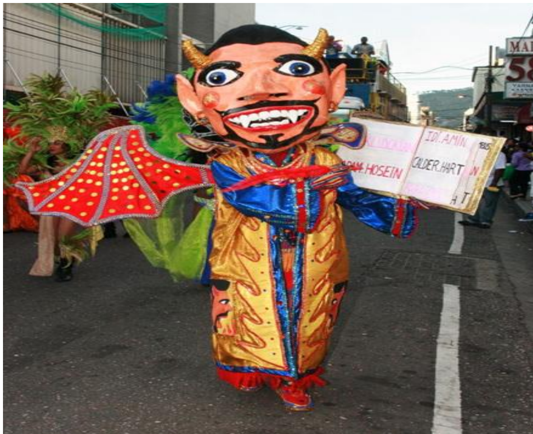
Figure 9. Bookman