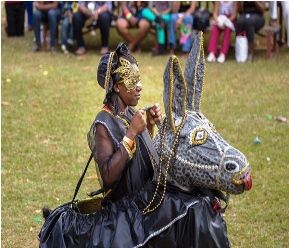
Figure 1. Burrokeet

Some say it’s just a facade Better known as masquerade On one side is pageantry In splendour and artistry Alas! On the other side Dangers lurk far and wide Removing the moral code All forms of vulgarity Blatant promiscuity Spirit of ‘bacchanalia.’ (La Borde, 2009, ¶ 1, 2, 3).