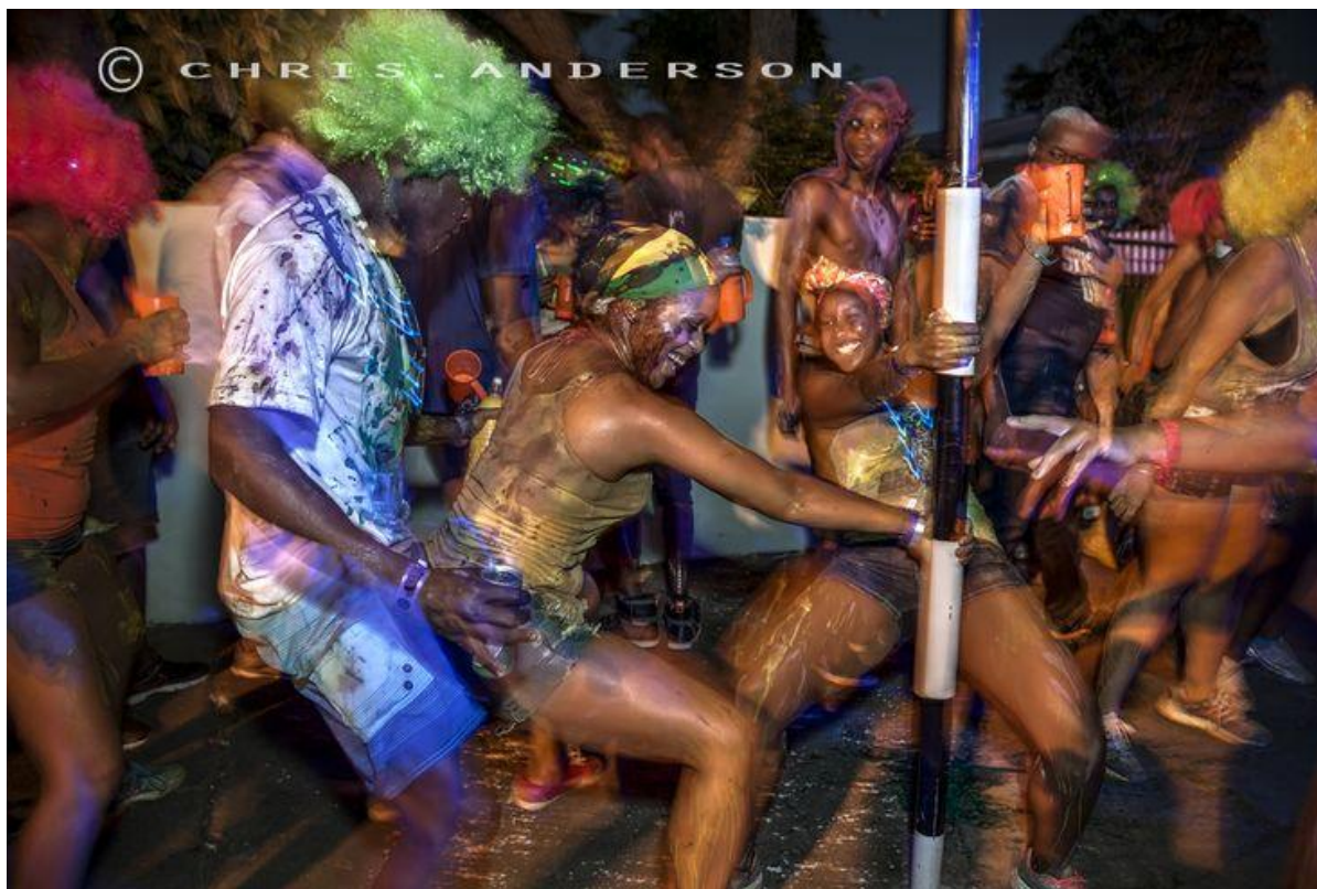
Figure 19. Woman at J'ouvert