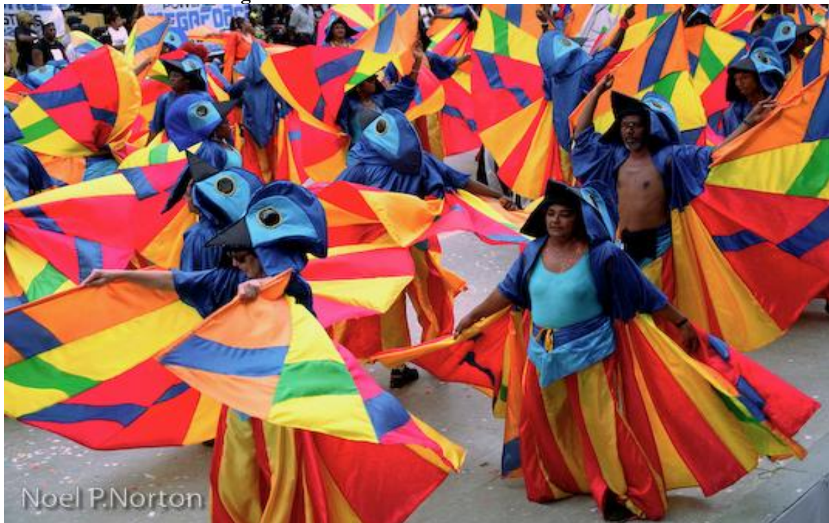
Figure 29. Conservative female mas costumes