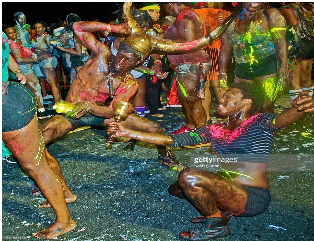
Figure 18. Man at J'ouvert