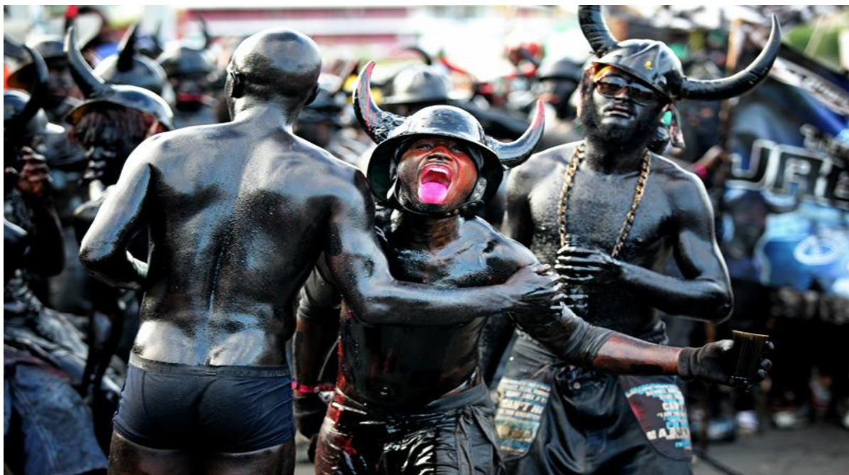
Figure 4. Jab jab, Grenada