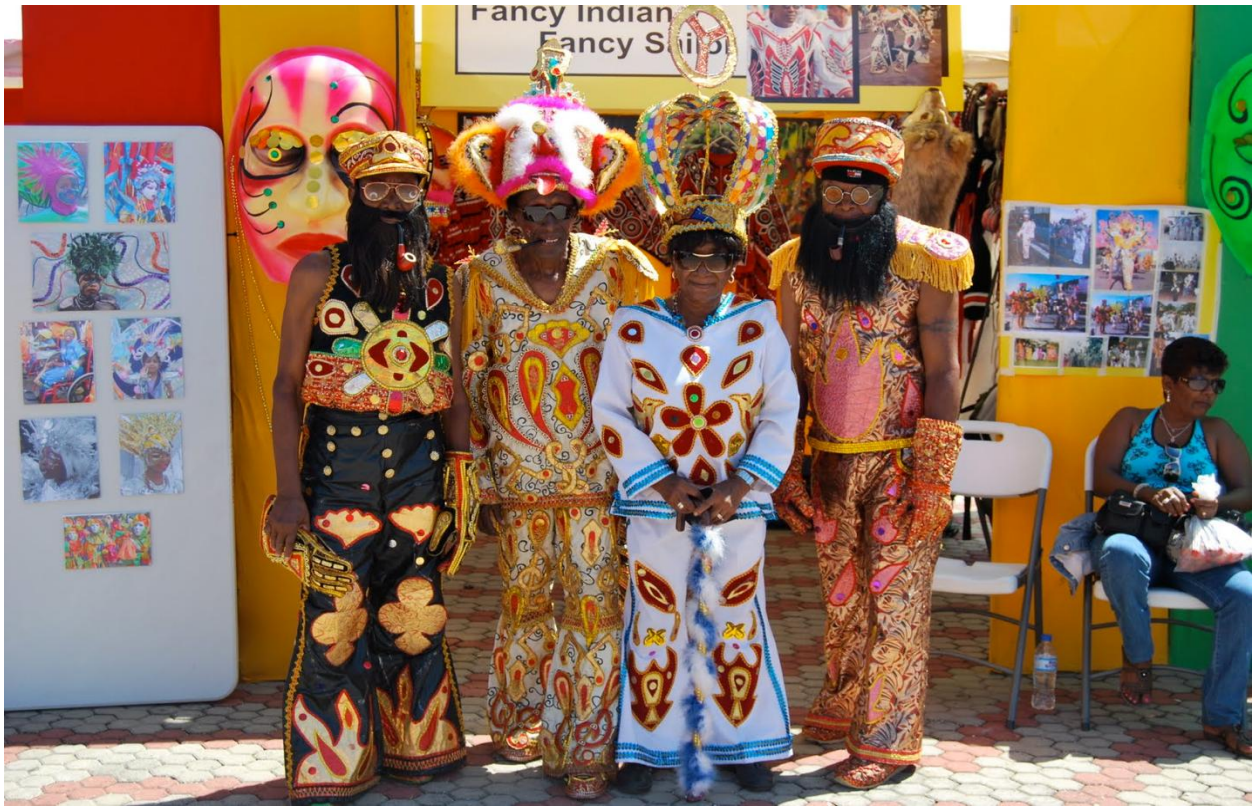
Figure 10. Sailors