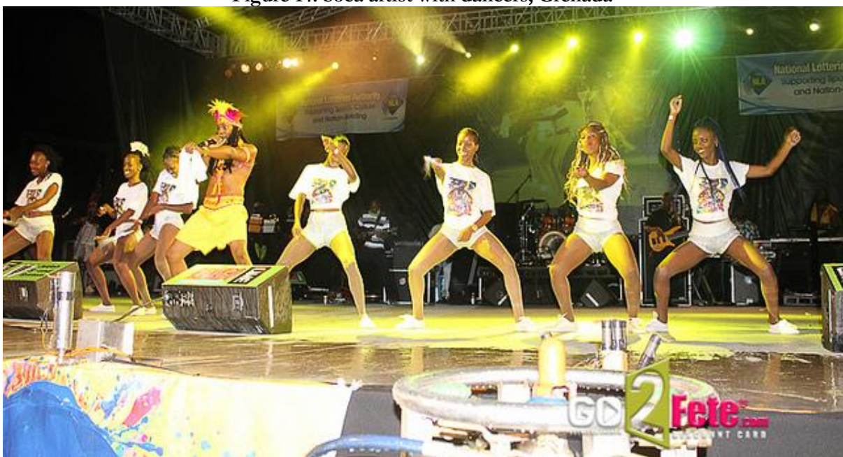
Figure 14. Soca artist with dancers, Grenada