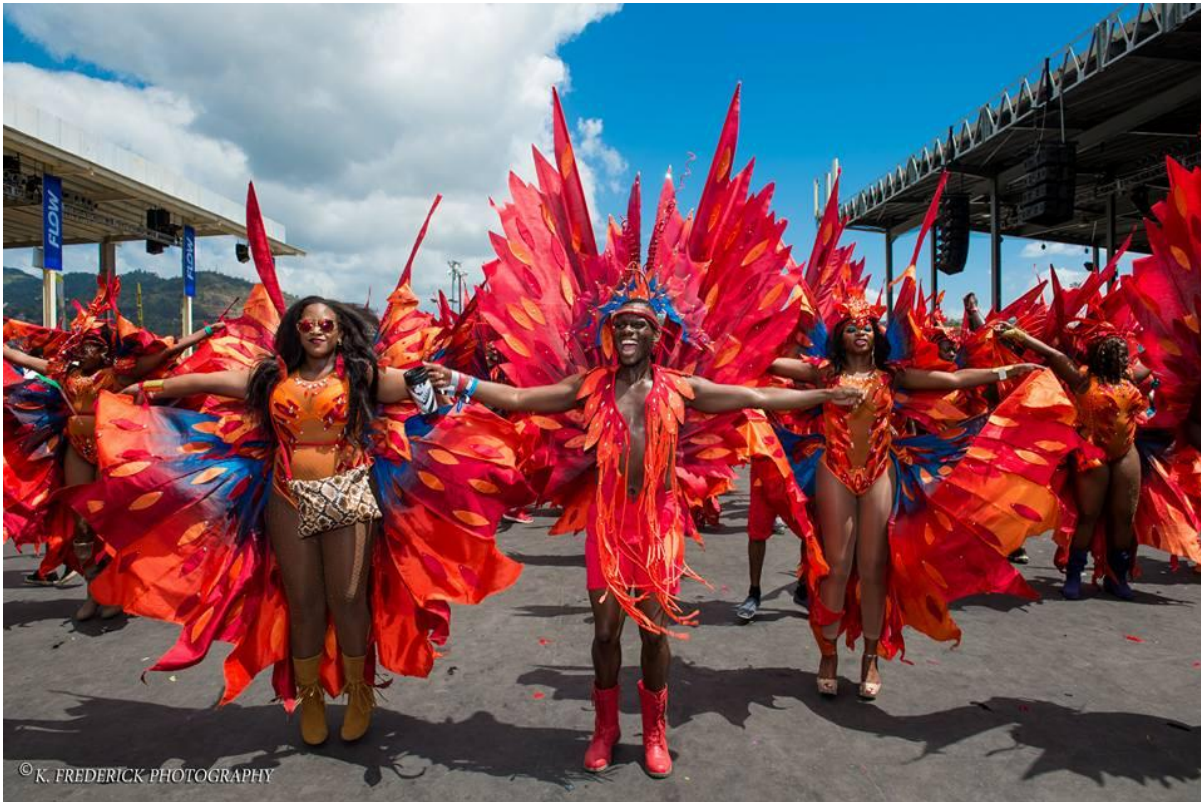
Figure 21. Mas band