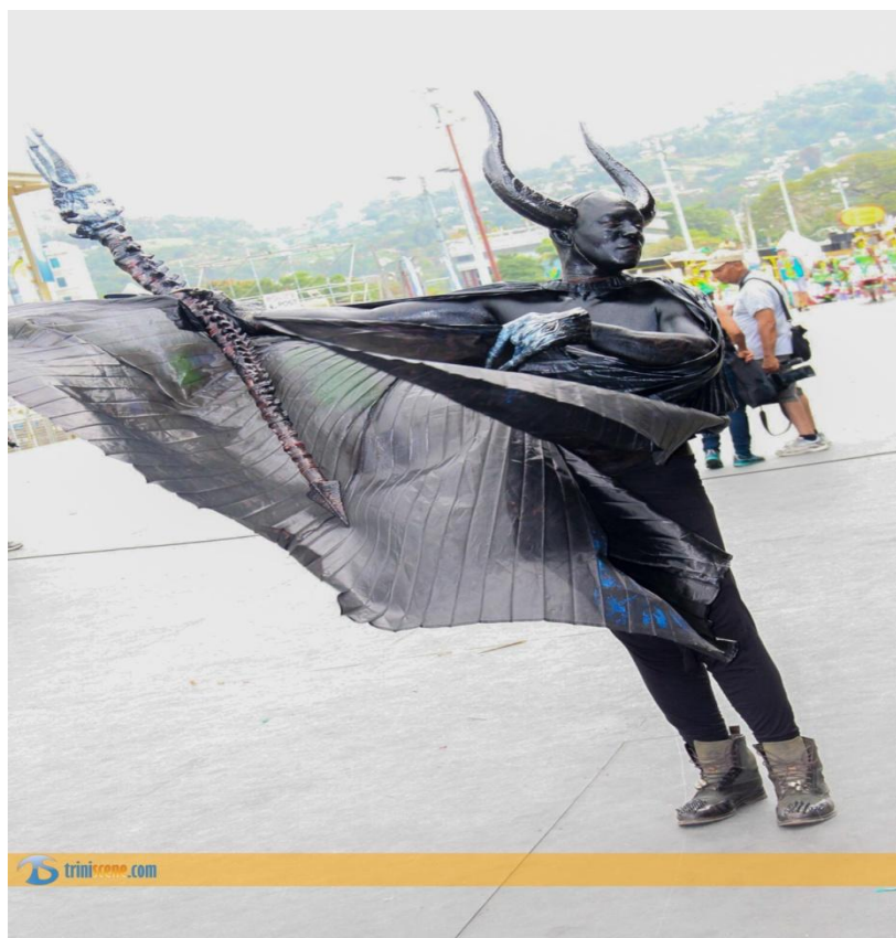
Figure 5. Jab molassie, Trinidad