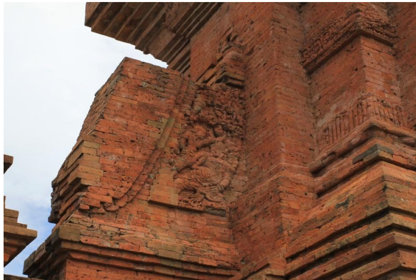
Figure 3. Sri Tanjung Relief