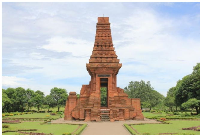
Figure 1. Candi Bajang Ratu

In terms of the preparation of the symmetrical and symbolic motifs of the esthetic forms, Candi Bajang Ratu symbolizes the unity present in the life of the various religious Majapahit communities, namely those following Javanese, Hindu and Buddhist beliefs. When viewed vertically, Candi Bajang Ratu consists of three parts, namely the bottom, the body and the head. In addition, this candi also has wings and a wall fence on both sides (Figure 1).