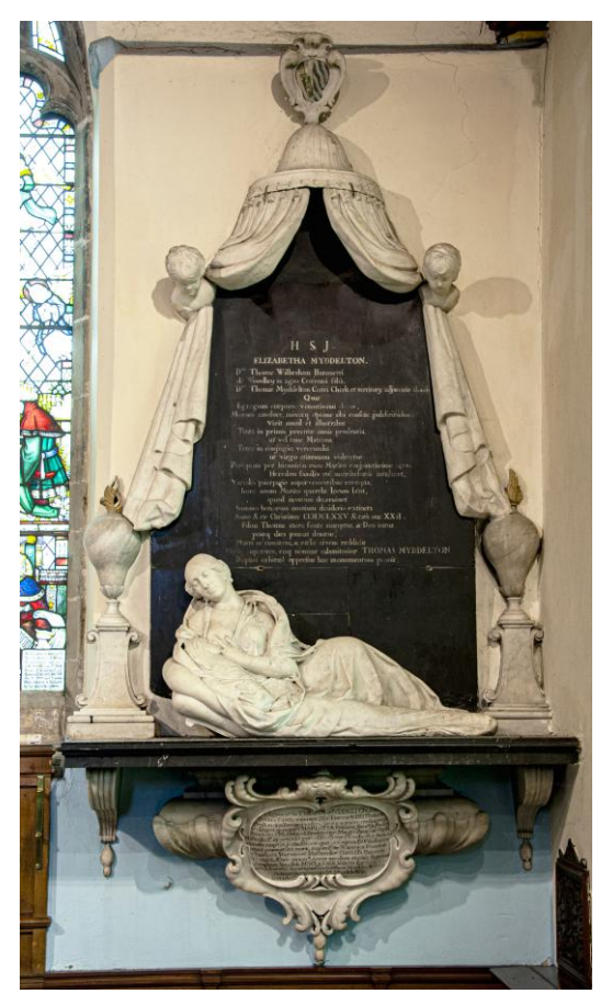
Fig 8 Monument to Lady Elizabeth Myddleton 1675 Chirk, Wrexham

Both monuments are very different in style, the parental monument having portrait busts on pedestals and Lady Elizabeth is shown as a reclining effigy. Beneath the main shelf on the parental monument is an inscription tablet in a rather 'fleshy' surround accompanied by winged putti while on Lady Elizabeth's monument, a secondary inscription panel is set in front of a semi-gadrooned flattened sarcophagus. The main feature common to both monuments is a Baldacchino held open by two putti. (Fig 8)