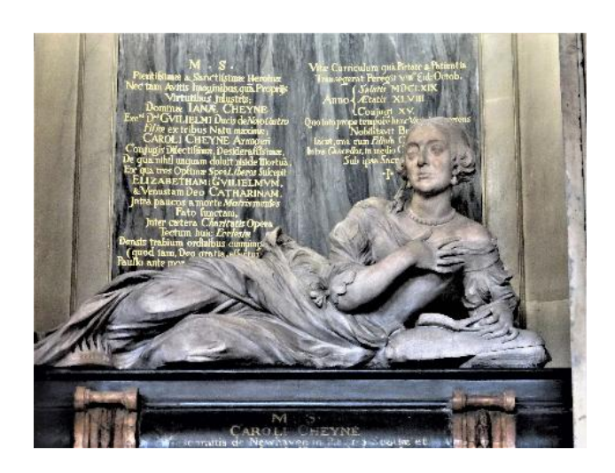
Fig 5 Effigy of Lady Jane Cheyne d1669 Chelsea Old Church

surprise, almost as if the spectator is interrupting her reading, the right hand raised to the chest in a display of mild alarm. (Fig 5)