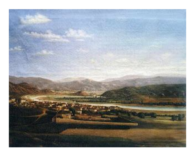
Figure 10: The Town Lefka, Ahmet Sekur (1856-?)

Painted one of the many rivers he put the curve of the river on left as a valley floating to right. A group of white clouds balanced the hill on right. The mountains behind the scenery melting in the air, while the sky is turning into blue. Reflected the view as a real life photograph with a slight touch of expressive styling.