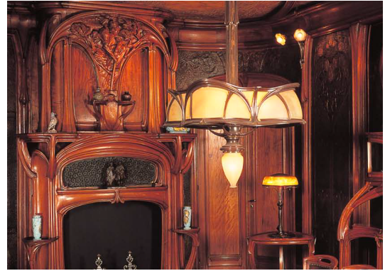
Figure 12 Eugène Vallin, Masson- House, Nancy, France, 1903 (Pile, 2005)