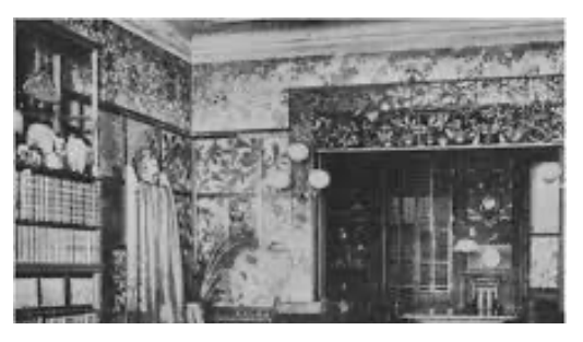
Figure 2 Louis Comfort Tiffany, Tiffany Residence, New York, 1883–4 (Hawley, 1976)