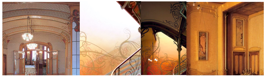
Figure 11 Art Nouveau- Victor Horta, Tassel House, Brussels, 1892 (Pile, 2005)