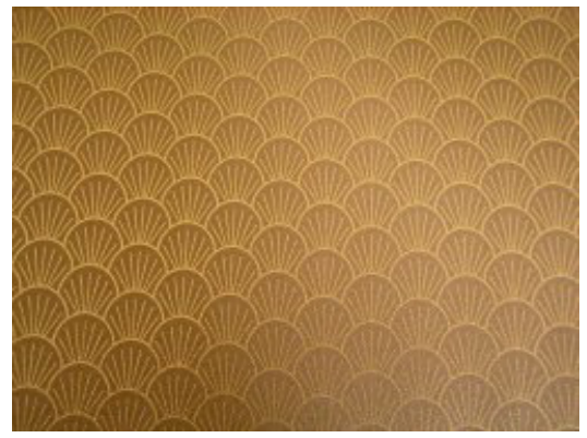
Figure 25Art Deco Wallpaper for a Doll's House (Decolish.com, 2020)