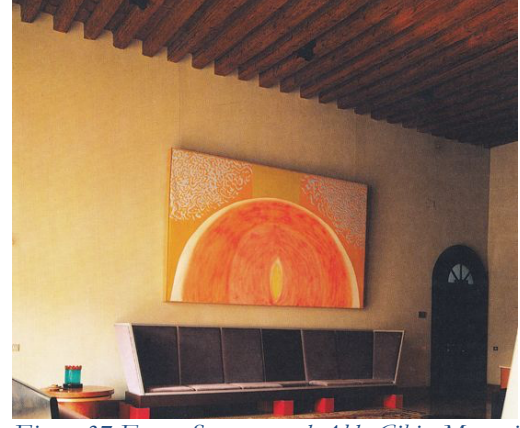
Figure 37 Ettore Sottsass and Aldo Cibic, Munari Apartment, 1983.(Sottsass, Ettore Sottsass and Aldo Cibic, Munari Apartment, 1983, 1983)