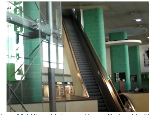
Figure 35 Milano Malpensa Airport. Designed by Ettore Sottsass. MXP(Anset2000, 2012)