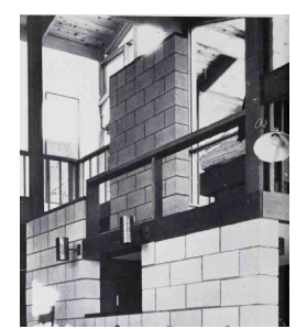
Figure 18 House in Grotan, Massachusetts, by Maurice Smith, c. 1966(McCorquodale, 1983)