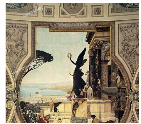
Figure 6 Art Nouveau . Gustav Klimt. Theatre in Taormina. 1886. (Klimt, The Theatre Of Taormina, 1886)