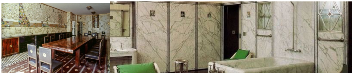
a)Dining room. B)Bathroom Figure 15 Josef Hoffmann, Stoclet House, Brussels, 1905–11(Stoclet, 2016)(katariMag, 2020)

Therefore, it is evident from this analysis that the visual characteristics of the wall coverings adopted the two dimensional Art Nouveau style. There would be uniqueness for both public and residential spaces. Figures of contrasting colors were used in public interior walls. For the residential interior walls, the flowing curves were extensively employed with natural colors employed. A common visual feature was noticed from examples of public and residential interiors that bright green and white background was used in both of them (Figure 14 and Figure 15).