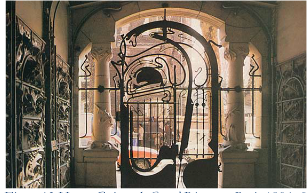
Figure 13 Hector Guimard, Castel Béranger, Paris, 1894–9. (Pile, 2005)