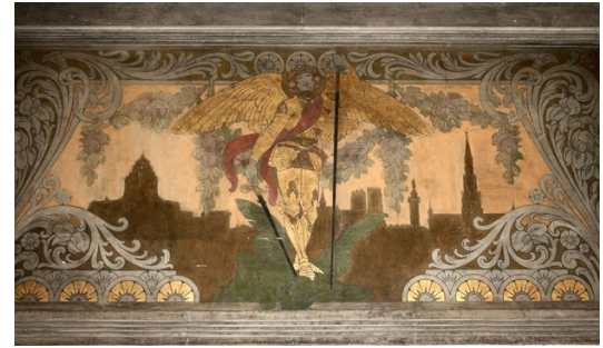
Figure 7 Art Nouveau Mural-Rue des Capucins 58-Brussels(Art Nouveau World, 2009 (taken))