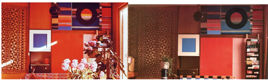
Figure 38 Sottsass's Milan apartment in 1958. (Sottsass, 1959) (Weinberg, Remembering Ettore Sottsass on His Centennial, 2017)