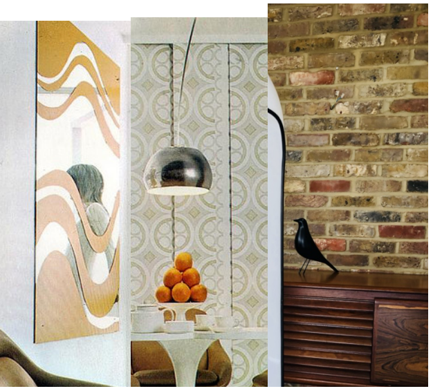
Figure 31 Stunning Space Age Guzzini Alba Floor Light Sergio Brazzoli & Ermano Lampa(Vinterior, 2019) (Young, 2020)

Space Age designs used motifs such as atomic bursts, UFOs, satellites, capsule and pod-shapes (Vinterior, 2019).In1961, architects William Pereira and Charles Luckman designed the LAX Theme Building. Its design is based on a large glass dome and a unique design of 135 foot parabolic arches and transparent walls and metallic organic designs giving impression to the imagined space materials (Figure 32)(Young, 2020).