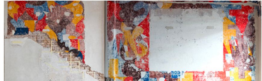
Figure 22 Giacomo Balla's mural, recently rediscovered in a building under renovation.