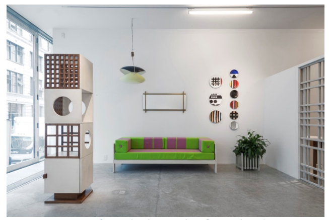
Figure 36 Early work of Memphis Group founder Ettore Sottsass(HALLIE, 2017).