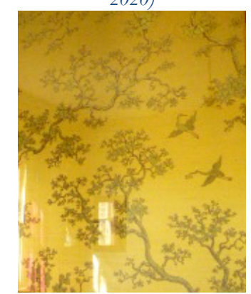
Figure 26Florence Broadhurst Wallpaper - Framed (Decolish.com, 2020)