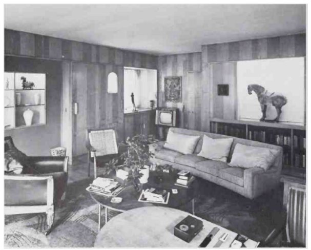
Figure 28 No. 64 Old -Church Street, Chelsea, London, by Erich Mendelsohn and Serge Chermayeff, 1936 (Pile, 2005)