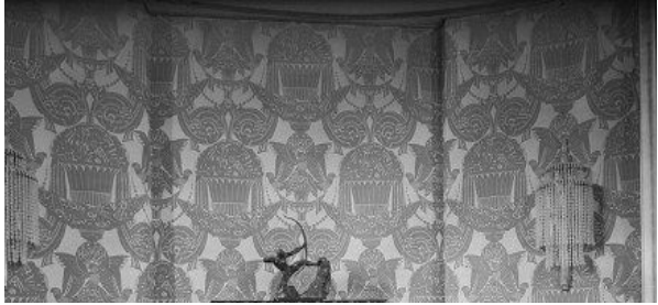
Figure 23 Salon of The Pavilion of a Collector, by Jacques Kuhlmann, International Exhibition of Decorative Arts and (Fabienne, 2009)

Figure 23represents Salon of The Pavilion of a Collector, by Jacques Kuhlmann, International Exhibition of Decorative Arts and Modern Industrialists, Paris, 1925 in which the walls are covered with a repeat pattern in silk showing stylized flower vases, flowers and birds beneath a large frieze apparently executed in plaster (McCorquodale, 1983). Figure 23to Figure 26depict several designed walls and papers indicating the pattern based designs clearly depict the art deco style features.