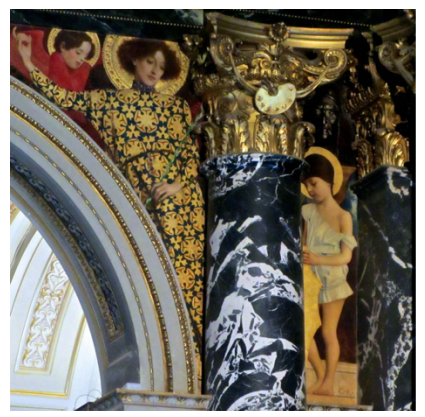
Figure 5 Mural painting- Gustav Klimt- 1891 (Sandi, 2018)

Figure 14 depicts Otto Wagner's (1841–1918) interior design of the Karlsplatz station in Vienna (1898) used golden decorative detail reflects the Art Nouveau- white, green, and gold ornamented the lobby. Hoffmann designed the dining room's interior including the walls of warm thin sheets of colored marble edged with fine strips of metal ornaments plated with gold (Figure 15). Gustav Klimt designed the mosaic murals were used on the side walls. Some other rooms were executed using various colors of marble geometrical designs (Pile, 2005).