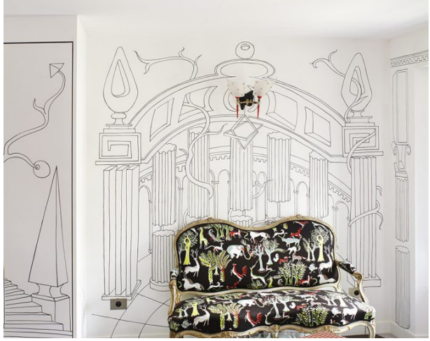
Figure 30 For an artist's bedroom that Darré nicknamed "the graffiti suite," the designer was inspired by "a shut-away poet who draws baroque."(SIERACKI, 2019)

Surrealism is a cultural movement in modern art and literature that aims to expressing the subconscious mind in a way that lacks order and logic. It was developed in Europe during the first world war. This style has been applied in the field of interior design including wall coverings (see Figure 30). Vincent Darré is a well-known interior designer for adopting Surreal interior design creations mixed with other style i.e. baroque, cubism, futurism and art deco styles ."(bocadolobo.com, 2017)