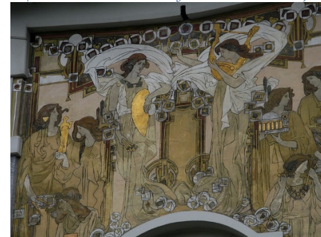
Figure 8 Art Nouveau Mural - House in Brussels