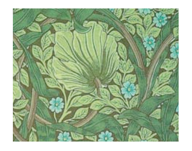
Figure 1 Sample of Wallpaper Design- William Morris-1876. (Pile, 2005)

Therefore, it is evident from the analysis of the wall coverings adopted by the Arts and Crafts style, these are characterized by the typical features of this style including floral patterns, abstracted animal figures with color palette involve dark greens, reds and oranges and the beige as background.