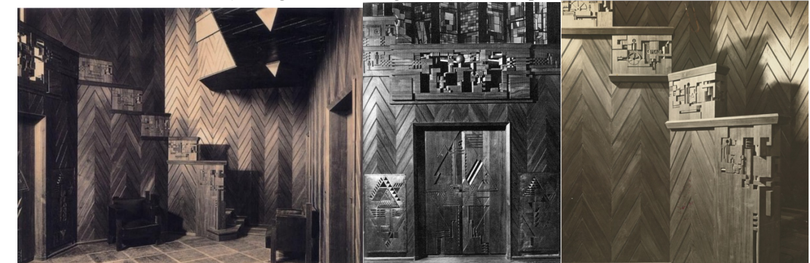
Figure 27Sommerfeld House, Berlin, by Walter Gropius, Adolf Meyer and Joost, Schmidt, 1921-2. (Jones, 2016) (Harrington, 1920)

The Bauhaus movement has mixed both arts and crafts feature and modernism features serving the function of the product. Therefore, simple geometrical designs were used in this style. Geometrical walls employing cladding wood ornaments were obviously used in Sommerfeld House, Berlin, by Walter Gropius, Adolf Meyer and Joost, Schmidt, 1921-2 (Figure 27). Another design feature used in the 1950s is the see-through interior wall spaces and partitions employing divisions such as low heights of book cases and/or cupboards giving a possible view to what is behind (see Figure 28 and Figure 29).(McCorquodale, 1983) (Heinz, 2002)