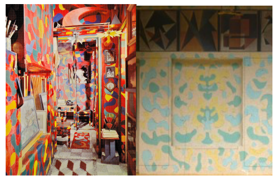
Figure 21 Casa Balla, in Rome, The home of the Futurist painter, sculptor and set designer Giacomo Balla(Phelan, 2018)(lablog, 2014)

Designers were able to develop patterned walls using the available stencil technique which affected the design style of the walls. The colors were contrasting, and sometimes metallic paints were used. Dividing the walls was possible to make contrasting areas as well. The natural colors used at this era were the beige, cream and gray but not the white(Antique, 2015). Figure 21 presents the house of futurist designer Giacomo Balla in Rome depicting the freedom would be adopted in making the interior walls in the futurism. The color in the futurism is the main design element in this example bright colors are used in such a way giving dynamic impression. The patterns covering the whole walls using painting sand or wallpapers. Figure 22 shows rediscovered murals painted by Giacomo Balla in a building under renovation in Rome depicting bold colors (Phelan, 2018).