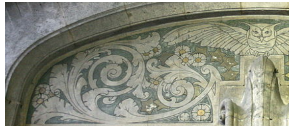
Figure 9 Art Nouveau -Rue des Capucins 58Brussels