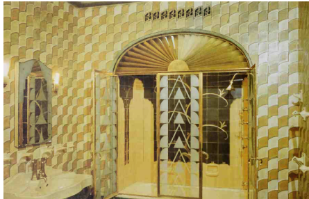
Figure 17 Bathroom in the Executive Suite, The Chanin Building, New York, 1929 Designed by Jacques Delamarre(McCorquodale, 1983)