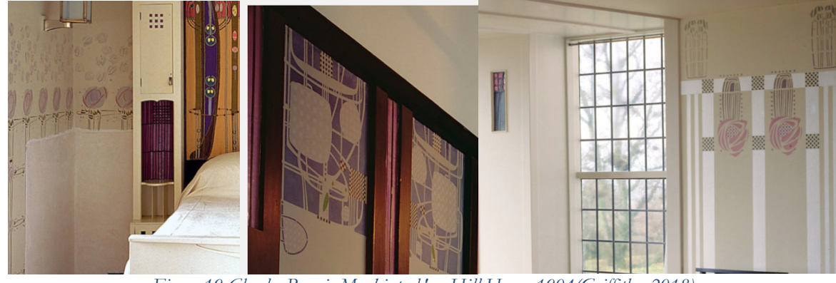
Figure 19 Charles Rennie Mackintosh's - Hill House 1904(Griffiths, 2018)