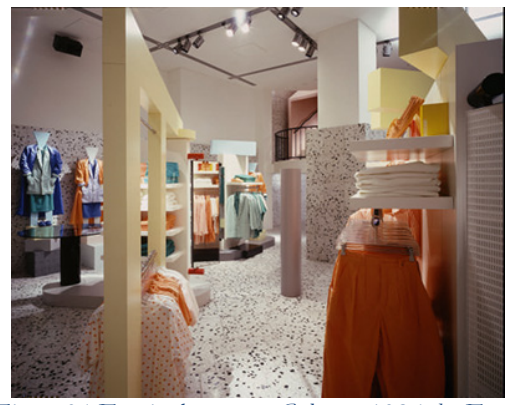
Figure 34 Esprit showroom, Cologne, 1986, by Ettore Sottsass(PHAIDON, 2020)

Ettore Sottsass worked on developing the Memphis movement to rebel against the minimalism style specifications. He applied his concepts in the interior. of Esprit's European expansion (fashion chain) aimed to developing a modern, dynamic and relaxed image – in tune with the times, and in keeping with the brand (PHAIDON, 2020). In Milano Malpensa Airport Interior Design by Ettore Sottsass, the columns look like Olivetti Synthesis series details of randomness, chaos, and mutability (Busche, 2016) (Anset2000, 2012)(Weinberg, Remembering Ettore Sottsass on His Centennial, 2017).(Figure 34 to Figure 38 depict samples of Sottsass interior designs).