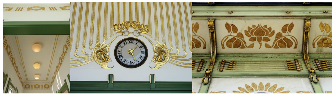
Figure 14 Art Nouveau- Otto Wagner Karlsplatz station in Vienna (1898)(VisistVienna, 2020)