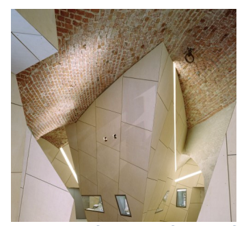
Figure 42 DANISH JEWISH MUSEUM Copenhagen, Denmark(WRIGHT, 2018)